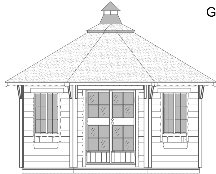
ARCTIC FINLAND HOUSE HUVIMAJA VICTORIA 12 m 2