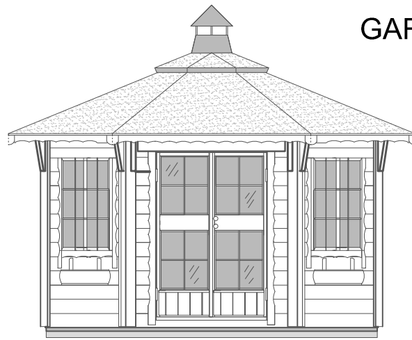
ARCTIC FINLAND HOUSE VICTORIA HUVIMAJA 6.5 m 2